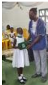
Another Mustard Seed, planted in Liberia