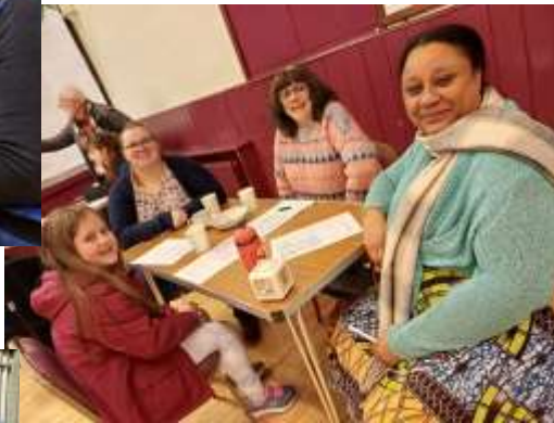
Parish Beetle Drive - 10th February