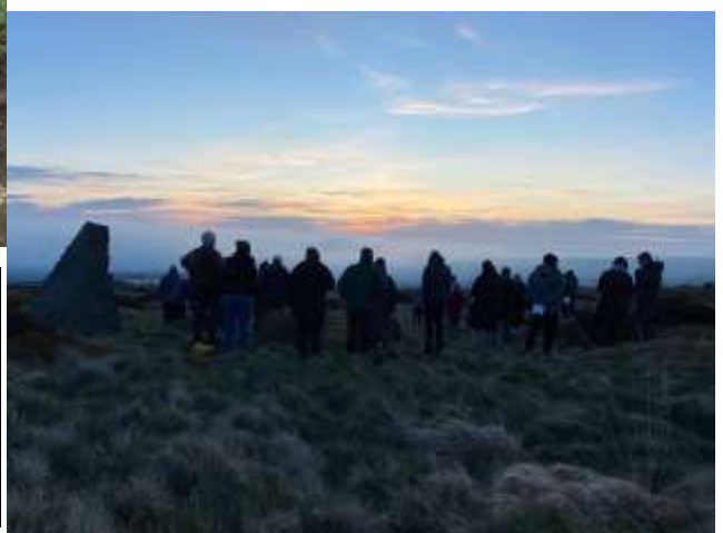
(Above) Easter Forest Church part of the Easter Trail making an Easter decoration. (Right) Sunrise Service at the Cock Crowing Stone. Easter Morning.